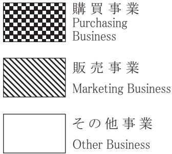
漁 協 (沿海地区漁協のみ Coastal District) Fishery Coops —平成16年度— Business Year,2004 (14,005)