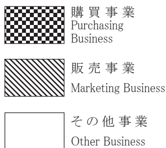
漁 協 (沿海地区漁協のみ Coastal District) Fisheries Coops —令和元年度— Business Year,2019 (11,798)